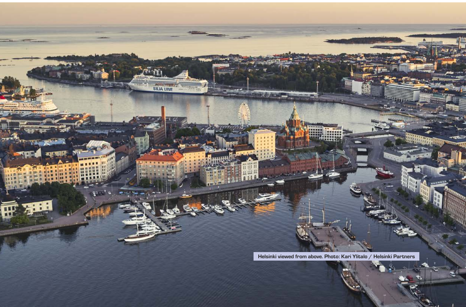
Helsinki viewed from above.