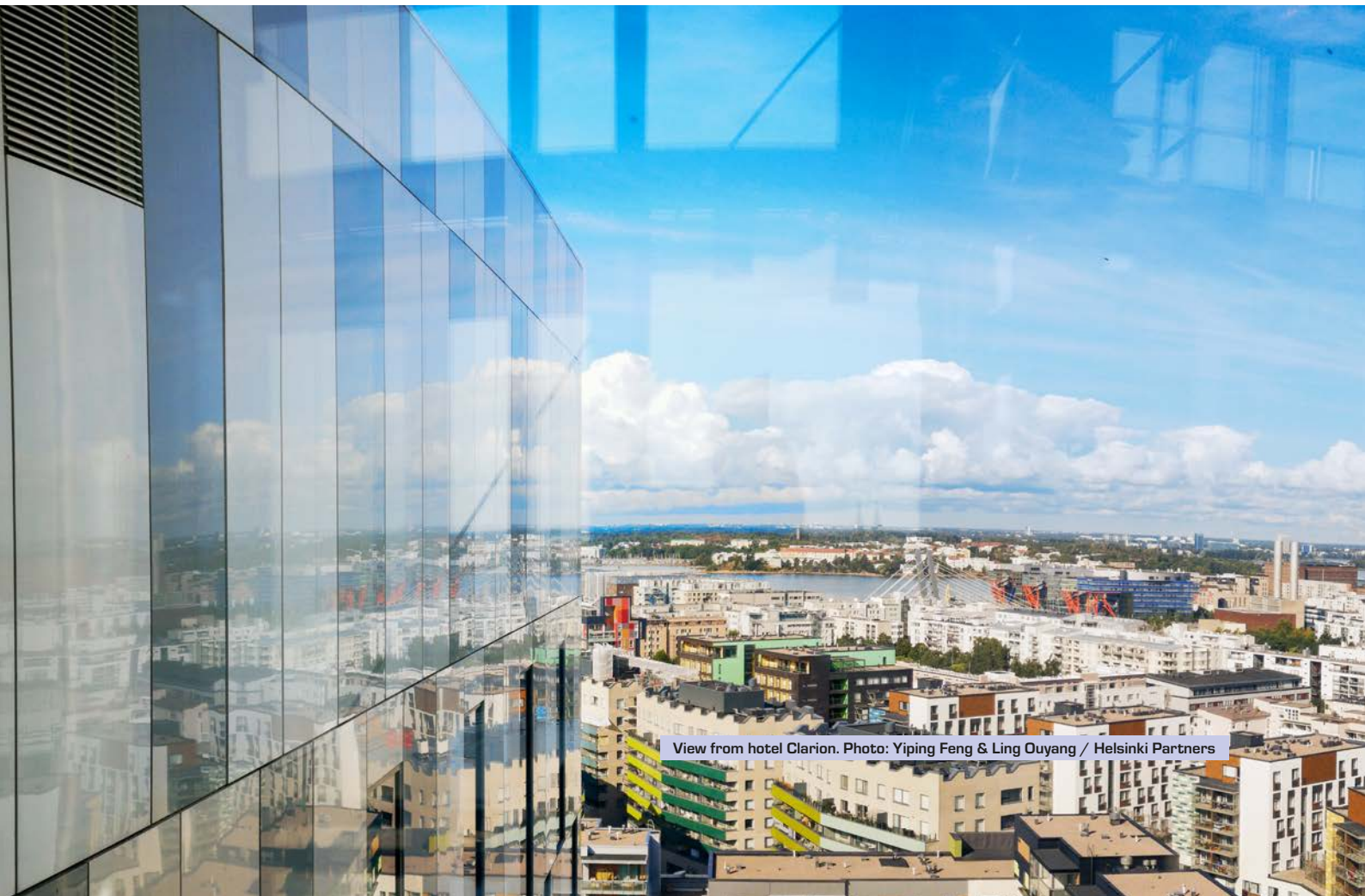
View from hotel Clarion.

Free Wi-Fi internet connection is available in the Congress Centre.